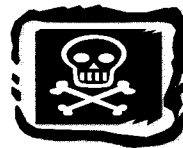
Figure 4. Poisoned Rope

Oh Nooooo! The Wicked Witch of Hixon Forest has poisoned the rope and this note. The first person that touched either one is now temporarily blind.