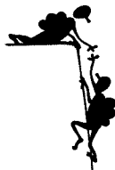
Figure 5. The Retrieval