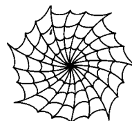
Figure 8. Spider Web

From time to time our little watcher of the forest likes to set her web right in the middle of the pathway to the Kingdom. If she catches you in her web, bad things can happen.